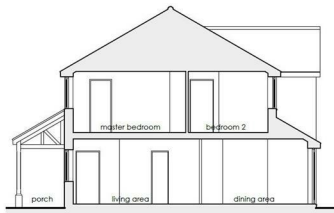
SECTION THRU A-A (1:100@A1)